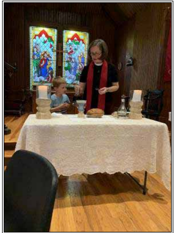
Parish Hall setting commemorating The Last Supper & Washing of Feet