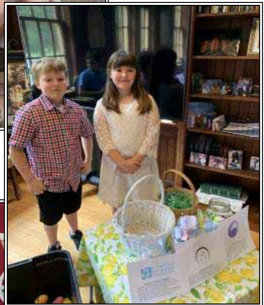
Proceeds from the Easter Egg Hunt were donated to The Diabetes Foundation of Mississippi, Haven House & Vicksburg Animal Shelter