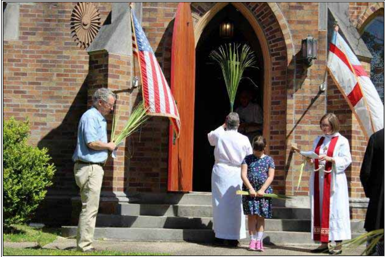
"All Glory Laud and Honor to Thee, Redeemer King!"