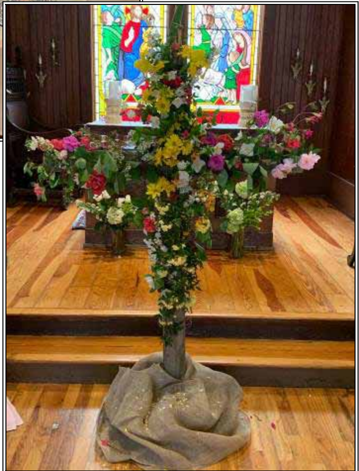
The Flower Cross, decorated by church members, adorned the Parish Hall. The array of fresh flowers and their lovely scent added to the ambiance of Easter Day.