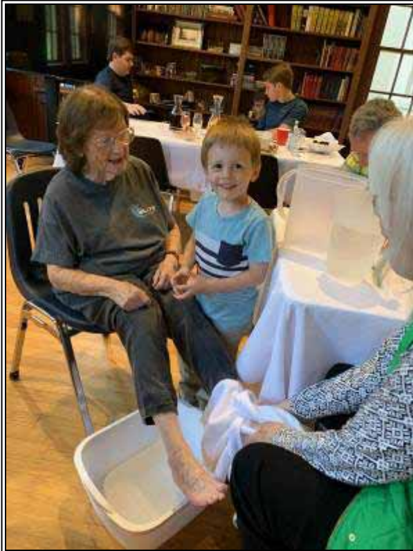
Fore observes foot washing